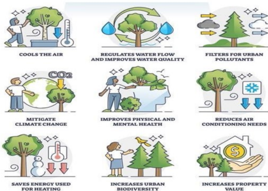
Figure 1: Sequential step-wise procedure for regulation of micro climate.