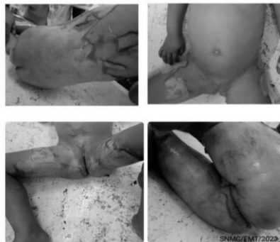
Fig 1 shows burn area over the body approximately 32% of total body surface area involved.

thermal burn (scald) due to spillage of hot tea. Patient was examined clinically and investigated accordingly. The findings were inconsistent with accidental burns as per the history given by the parents and raised the suspicion of child abuse.