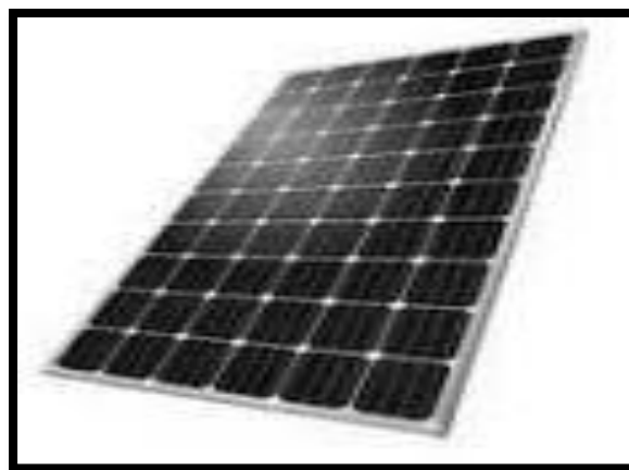
Figure 2: Solar Modules