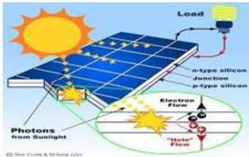
Figure 1: Solar Cell