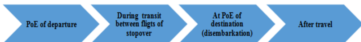
Figure 3: Potential Point of Detection of Life-Threatening Contamination

The activities, supposed to be performed in every stage of travel of traveler are shown in the Table1.