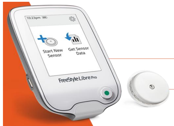
Image of Reader and Sensor