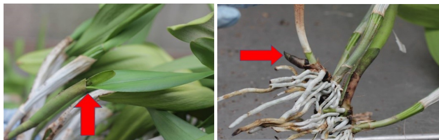
Green pseudobulb New shoot & white healthy roots below it