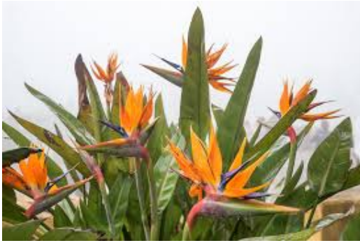
Bird of Paradise