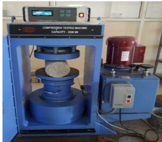
Figure 3: Split Tensile Test