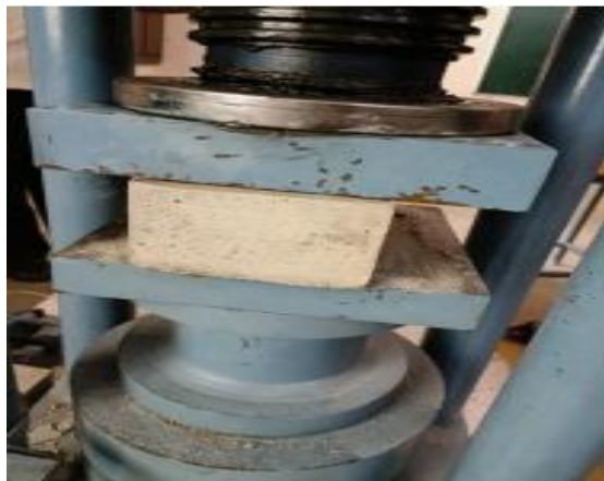
Figure 1: Compressive Strength Test on Concrete Cube