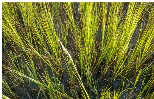
Figure 2a: Spartina alterniflora