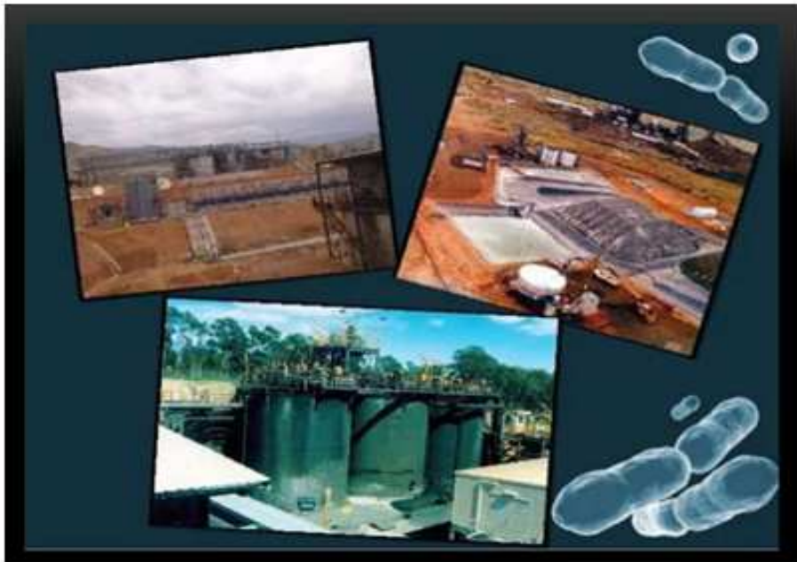
Figure 1: The extraction of live creature activated.