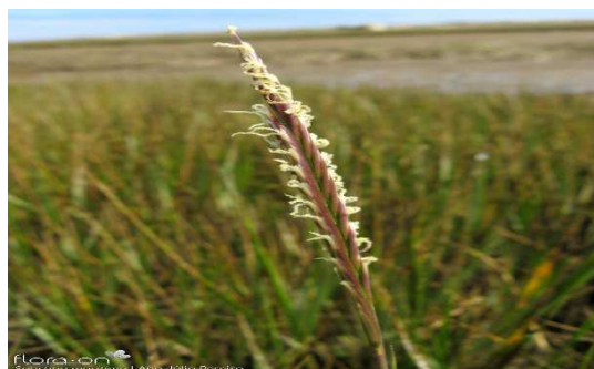
Figure 2b: Spartina maritima