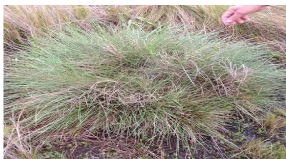
Figure 2c: Spartina argentinensis

Spartina alterniflora and Spartina maritima are two Spartina sp. that are often employed by researchers owing to their salt tolerance and ability to flourish in salt marshes. The minerals zinc and copper drew the greatest attention in this research indicating that these metals were more carefully examined than other heavy metal. Another Spartina sp. of Spartina argentinensis has the capable of hyperaccumulating particular heavy elements including chromium.