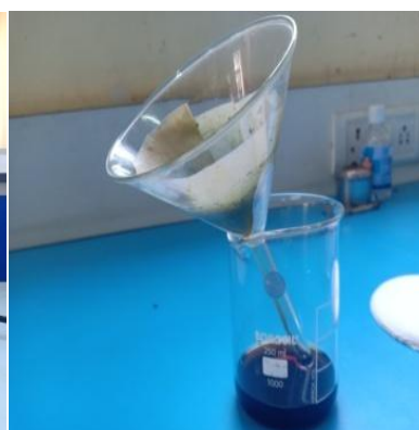
Figure 3: Filtration