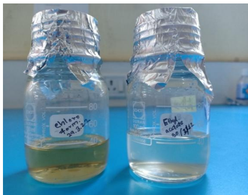
Figure 6: Mixture of a solid dissolves in a liquid