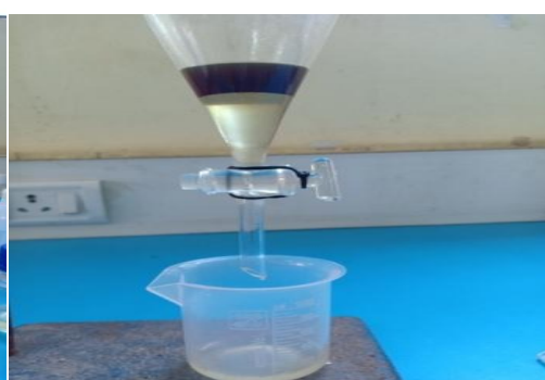
Figure 5: Separated between two immiscible liquid phases.