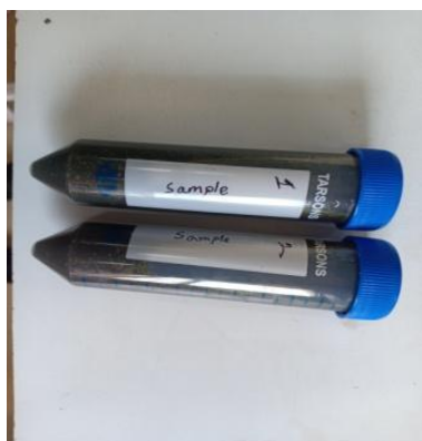
Figure 1: Plant dry Extract starring machine

Using a mechanical grinder, coarse powder was created from the dried barks. 20 grams of dry powder were extracted using a magnetic stirring machine in 200 ml of organic solvents at 50–60°C, including acetone and methanol. For 48 hours, the extractions went on as usual. The extracts were removed from the solvents using a rotary evaporator, and the resulting crude extracts were kept in sterile amber-colored vials kept at 4°C in a refrigerator until further investigation.