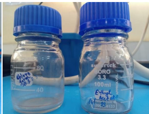
Figure 7: Only solid remains