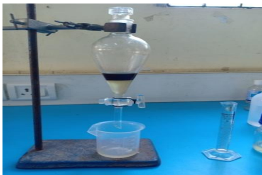
Figure 4: Separating funnel