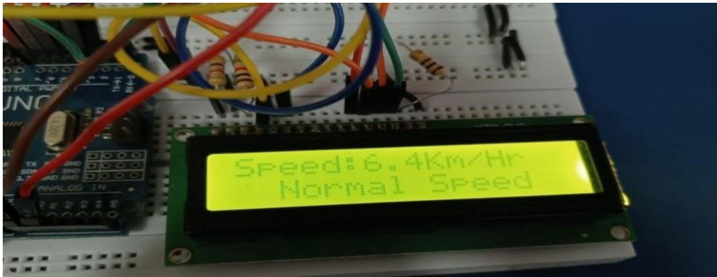
Figure 3: System shows Normal mode