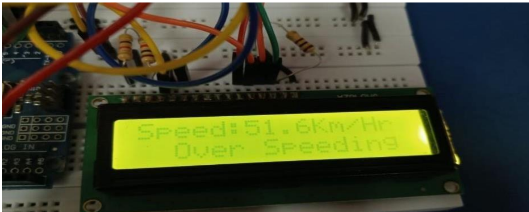
Figure 4: System shows the Over speed mode