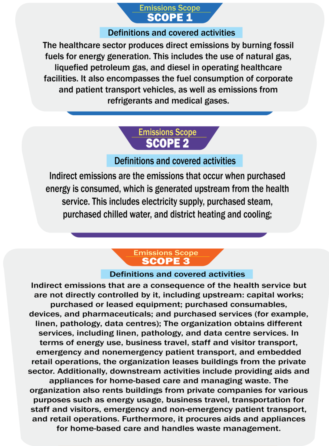
Exhibit: 1 - Describes the Allocation of Emissions Across these Scopes

Note: Gas emissions in Scope include carbon dioxide, methane, nitrous oxide, hydrofluorocarbons, perfluorocarbons, and sulphur hexafluoride.