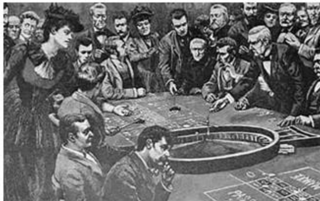
Figure 1: Gambling back to 3000 B.C.

The name "casino" is derived from an Italian term that means "a tiny dwelling."