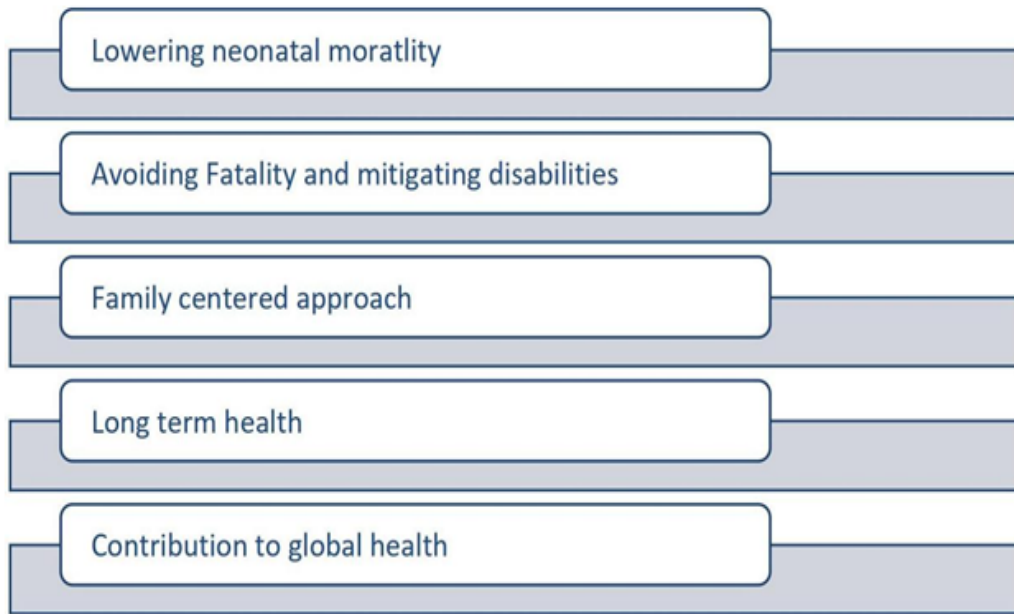
Figure 1: Components of Neonatal Care