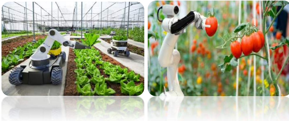
Figure 4: Robots being Used for Harvesting of Different Crops.