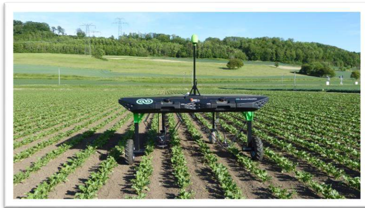
Figure 8: Robots Performing Weeding Activities.