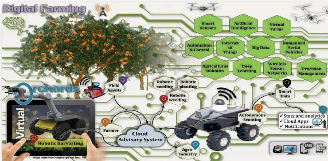
Figure 2: An illustration Emphasizing the Use of Agricultural Robotics in Digital Farming and Artificial Orchards.