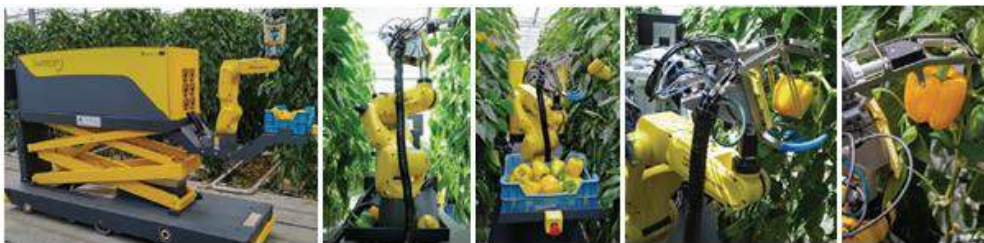
Figure 11: SWEEPER robot: The First Completely Automated Platform for Harvesting Sweet Peppers in the World.

Crop picking also calls for proficient hands and a light touch. In the summer, many fruits and green vegetables bruise easily. And the majority of robots simply aren't sophisticated enough to manage that level of accuracy. However, companies working on agricultural technologies are attempting to overcome that obstacle.