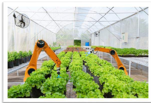
Figure 9: Robots in Green houses.

One of the next major developments in agricultural automation will bring bots for agriculture to the field, not the other way around. The foundation for a future powered by robots and greenhouses is being laid by a number of entrepreneurs. While not all plants can be grown in this manner, the benefits are noticeable for some crops. These businesses advertise controlled indoor settings that do not require pesticides, as well as a huge reduction in water usage (between 90 to 95 percent less) for a comparable crop output.