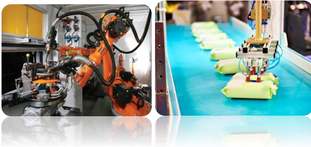
Figure 10: Robots being used for Sorting and Packing of Commodities.