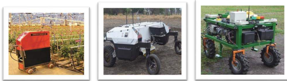
Figure 5: Spray robot Figure 6: Agbot-II Figure 7: Autonomie Robotor

by it. As a result, farmers are utilising micro-spraying robots to mitigate the effects. Future advances in computer vision will enable weed detection and targeted pesticide spraying by micro-spraying robots.