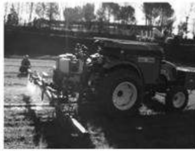
Figure 3: Robotized Patch Sprayer (Gonzalez-de-Soto et al. , 2016)