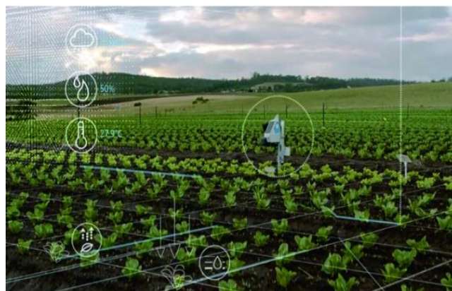
Figure 3: An automated smart irrigation system based on AI technology

A representation of an automated smart irrigation system based on AI technology is illustrated in Figure 3, signifying the potential advancements in irrigation practices to ensure sustainable water usage in agriculture.