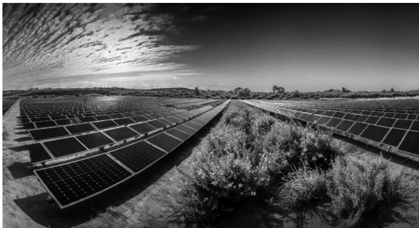
Figure 1: Photovoltaic Systems

Water pumping serves as a vital lifeline across various sectors, sustaining agricultural productivity, industrial processes, and community water supply. However, as global concerns over climate change and environmental impact intensify, traditional water pumping methods relying on fossil fuels or grid-connected electricity face scrutiny. In response to these challenges, the integration of photovoltaic (PV) systems for water pumping has emerged as a promising and transformative solution.