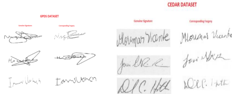
Figure 2: Signature Samples of GPDS and CEDAR datasets.