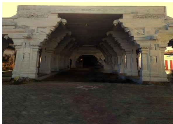
Figure 2: Temple Entrance