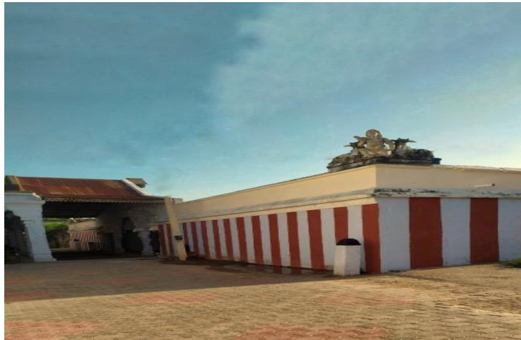
Figure 1: Shivan Temple

Shiva is one of Hinduism principal deities, and there are many temples dedicated to him throughout the country. In the south Indian state of Tamil Nadu, there are 2500 shiva temples of significance. Several type of temples can be found in Tamil Nadu, a state in South India. Ettayapuram shiva temple is famous among them.