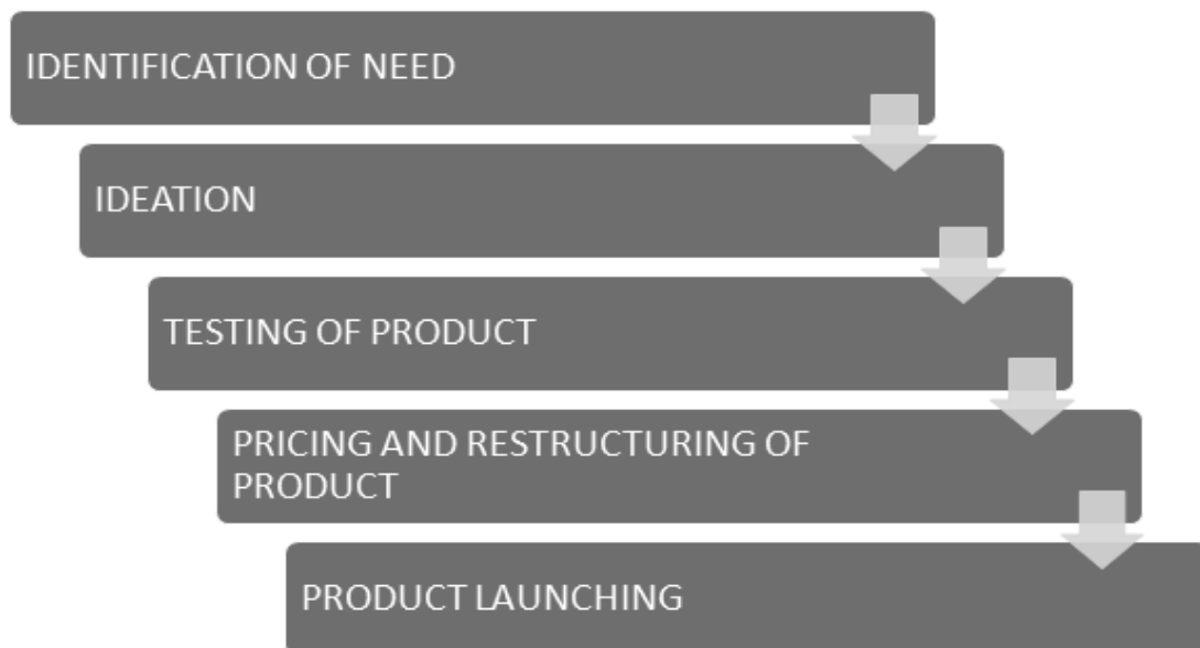
Figure 3: Financial Engineering Process

The process to create financially engineered products is no different from developing any new product. It consists of five stages, namely, identification of need, idea generation, testing of product, pricing, and restructuring of product, and launching of product.