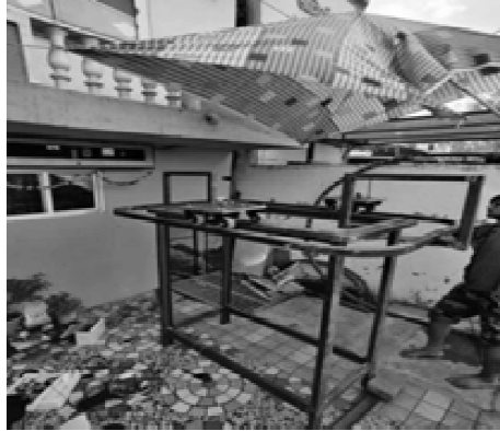
Figure 3: Assembly of Lift