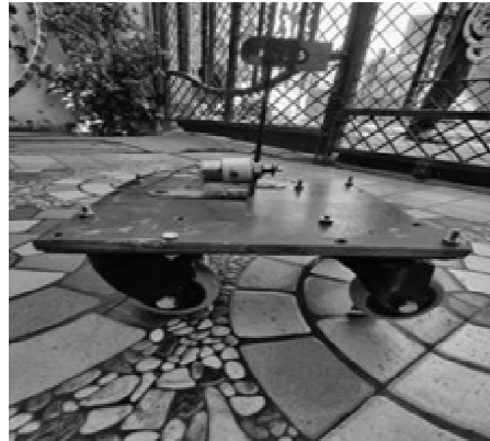
Figure 4: Trolley to rotate the lift around Building