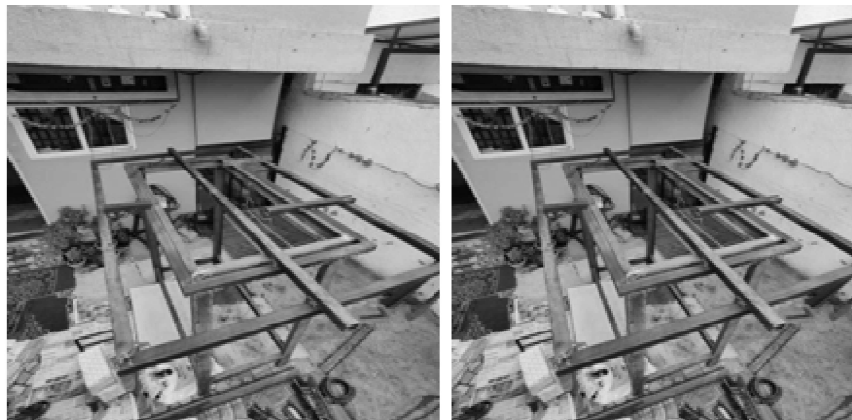
Figure 2: Fabricated Frame