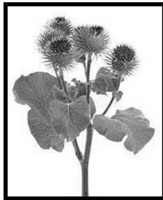
Figure 5 : Arctium lappa