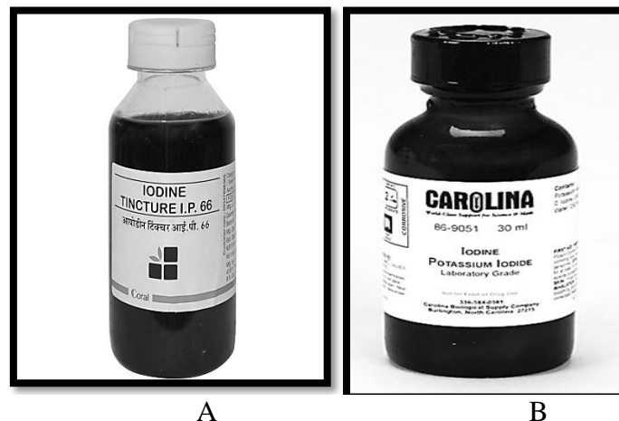
Figure 1: (A) Iodine tincture (B) Iodine potassium iodide solution