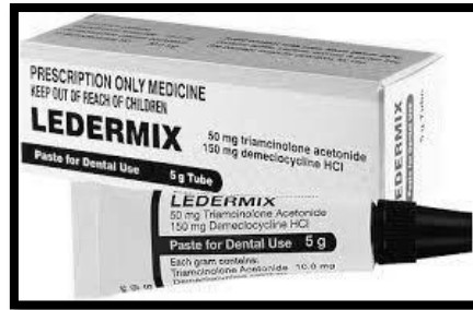
Figure 3: Ledermix paste