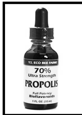
Figure 4: Propolis solution