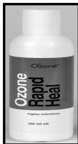
Figure 7: Ozonated oil