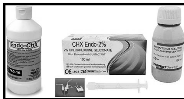
Figure 2: Chlorhexidine preparations