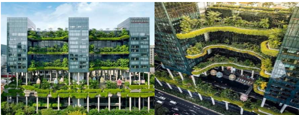
Figure 4: Parkroyal on Pickering, Singapore

Parkroyal on Pickering is an iconic hotel in Singapore known for its lush greenery and eco-friendly design. The project showcases the seamless integration of nature and architecture, incorporating various eco materials in its construction.