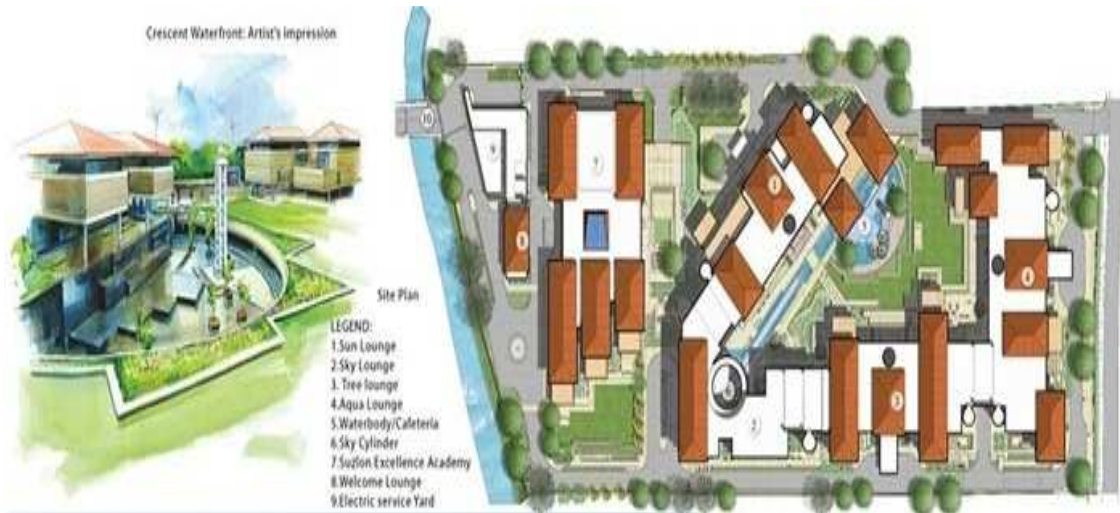
Figure 11: Suzlon One Earth Site Plan