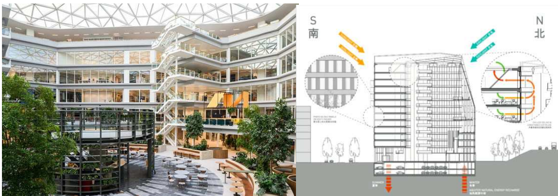
Figure 3: The Edge, Amsterdam, Netherlands

The Edge, located in Amsterdam, is widely recognized as one of the world's most sustainable office buildings. The project prioritized the use of eco materials throughout its construction and achieved the highest sustainability certifications, including BREEAM Outstanding.