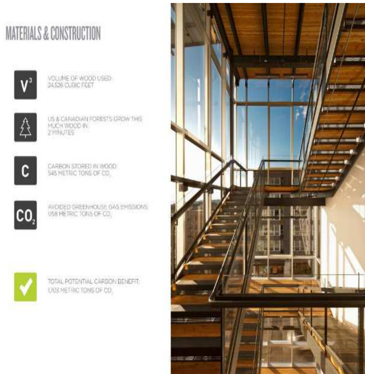
Figure 2: Material

2. Benefits and Achievements: The use of eco materials in the construction of the Bullitt Center has resulted in several notable benefits and achievements: