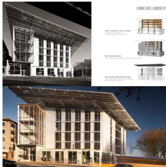
Figure 1: The Bullitt Center