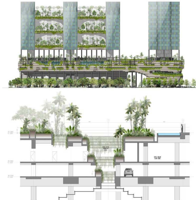
Figure 9: Parkroyal on Pickering Biophilic Design & Sustainability