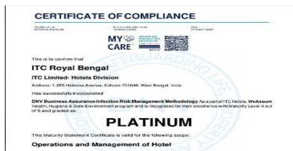
Figure 10: ITC Royal Bengal Hotel Rating