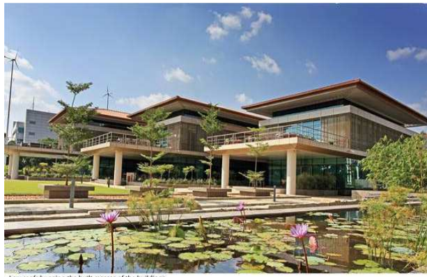
Figure 6: Suzlon One Earth, Pune, India

Suzlon One Earth, located in Pune, Maharashtra, is a landmark green building and a leading example of sustainable construction in India. The project incorporates a range of eco materials and sustainable design strategies to create an environmentally friendly and energy-efficient workplace.