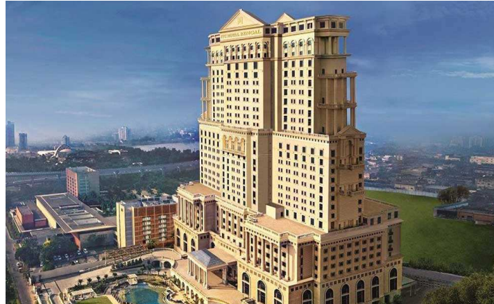
Figure 5: ITC Royal Bengal Hotel, Kolkata, India