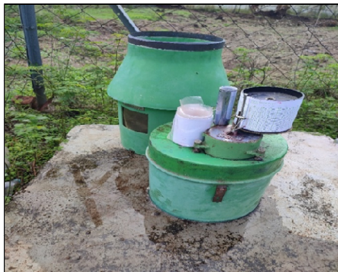
Plate 2.1 Float Type Self-Recording Rain Gauge