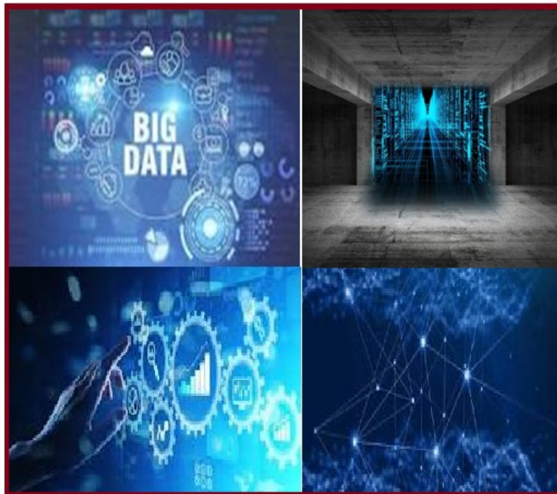
Figure 1: Big Data Technology