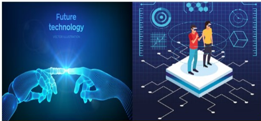
Figure 3: Digital Twin Technology