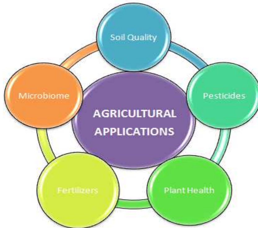
Figure 1: Applications of Sensors in Different Agricultural Sectors