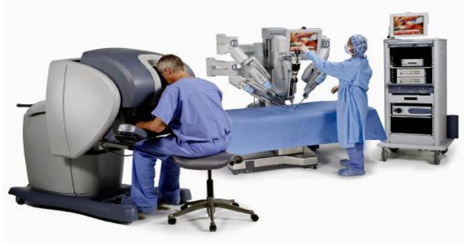
Figure 1: The da Vinci Surgical System.