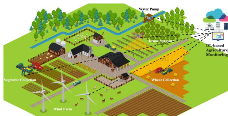
Figure 3: Deep Learning based Agricultural Monitoring