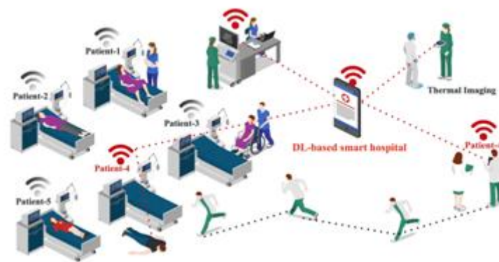
Figure 2: Deep Learning based Smart Hospital