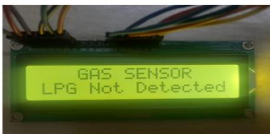
Figure 1: When LPG gas not detected

Investing in LPG gas as a fuel source significantly enhances house safety and industrial safety by preventing accidents and minimizing damage caused by gas leakage. Therefore, it represents a valuable and necessary investment. The use of LPG gas is not only efficient but also offers a crucial layer of safety in various applications, making it an essential choice for households and industries alike.