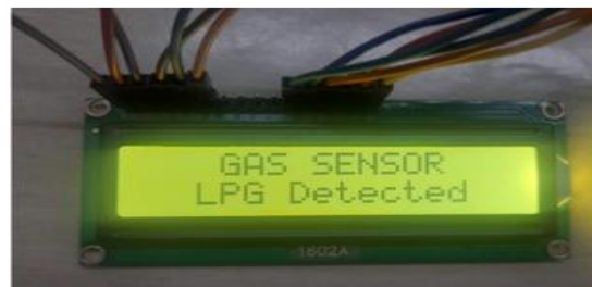
Figure 2: When LPG gas detected