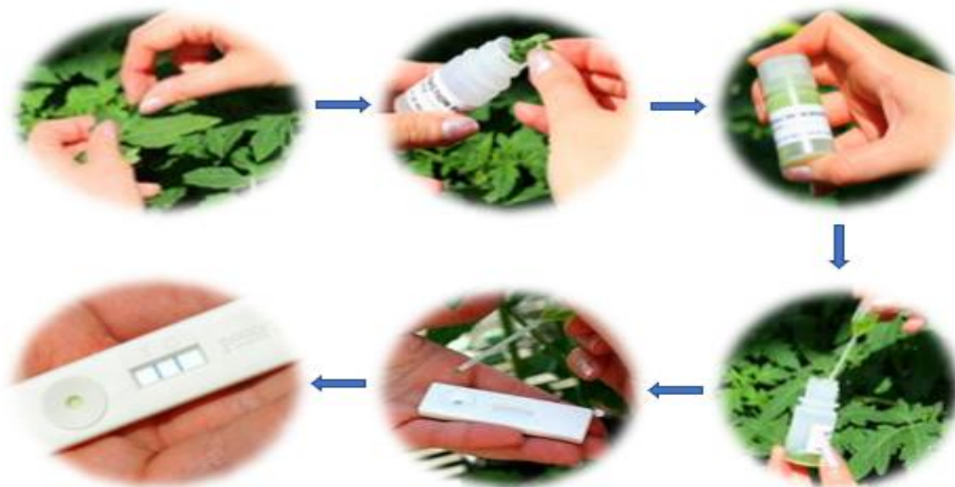
Figure 3: Test procedure of Pocket Diagnostic kit