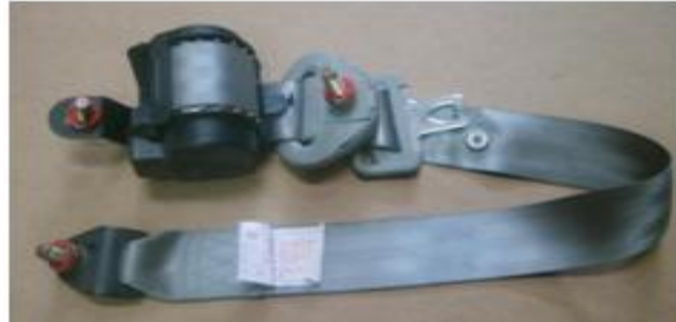
Figure 5: Seat & belt lock.