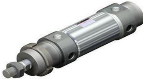
Figure 2: Double acting cylinder