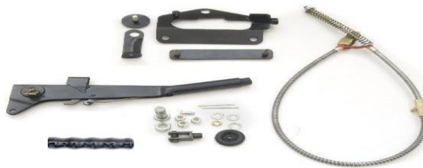
Figure 4: Hand brake set.