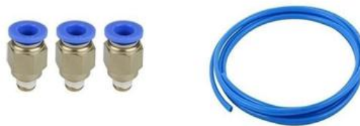
Figure 3: Pneumatic hoses and fittings.