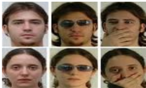
Figure 3: Facial recognition Features