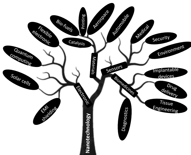
Figure 3: Various applications of nanotechnology different fields

pressing societal challenges. Furthermore, nanotechnology has the potential to drive economic growth, create new industries and job opportunities, and contribute to sustainable development.