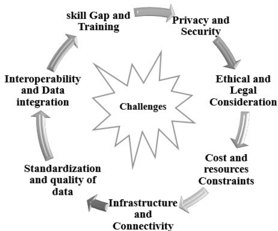
Figure 3: Challenges of Big data Implementation