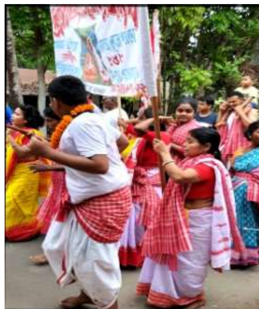
Figure 2: Devotees Celebrating Baruni Festival at Thakurnagar