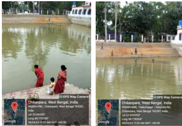
Figure 9: Kamana Sagar Pond

When the Monks, Dalapati, Vaktas come to the Thakurnagar that time they spread every where 'Batasha'. Because of that this Batasha is the main Prasad of Harichand Thakur. They spread Batasha towards vaktas who were come to Thakurbari and that is the way to pray to the God. As well as they pray for the God, they maintain some rituals like incense sticks, candles.