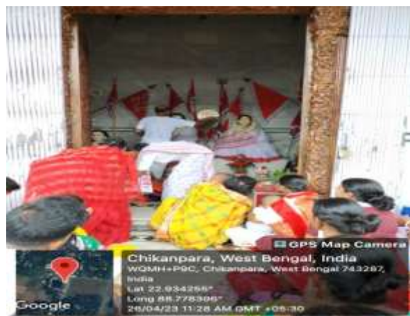
Figure 1: Matua People in the Temple

We know that every people or every human being has some basic needs and it is mandatory for every people or mankind. Man is the greatest creation by God so man will be valuable, kindful to others. Man eat it is his / her basic need so we can say that this eating is natural for every human being. As well as we lived in a society and we found that every people has many kinds of vision about society. It is true that food is basic need but it is also be truth some people don't want to share his food to others. We can say that culture is the mirror of a society so culture baring the all good or bad effect of society, which is occurring in our day to day life so we can say that we are the (Human being) greatest creation by god so he made us to create or facilitate for the society so we can say that don't look after yourself only, culture teach us every people is valuable and has specific role in our society.