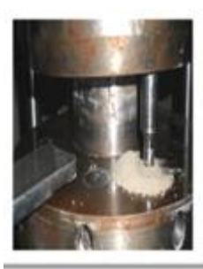
TABLET COMPRESSION MACHINE