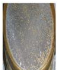
GRANULES ON SIEVE No 44