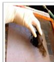
DOUGH MASS PASSED THROUGH SIEVE 10