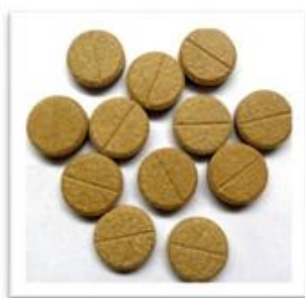
DISPERSABLE AMALAKHYADI TABLET