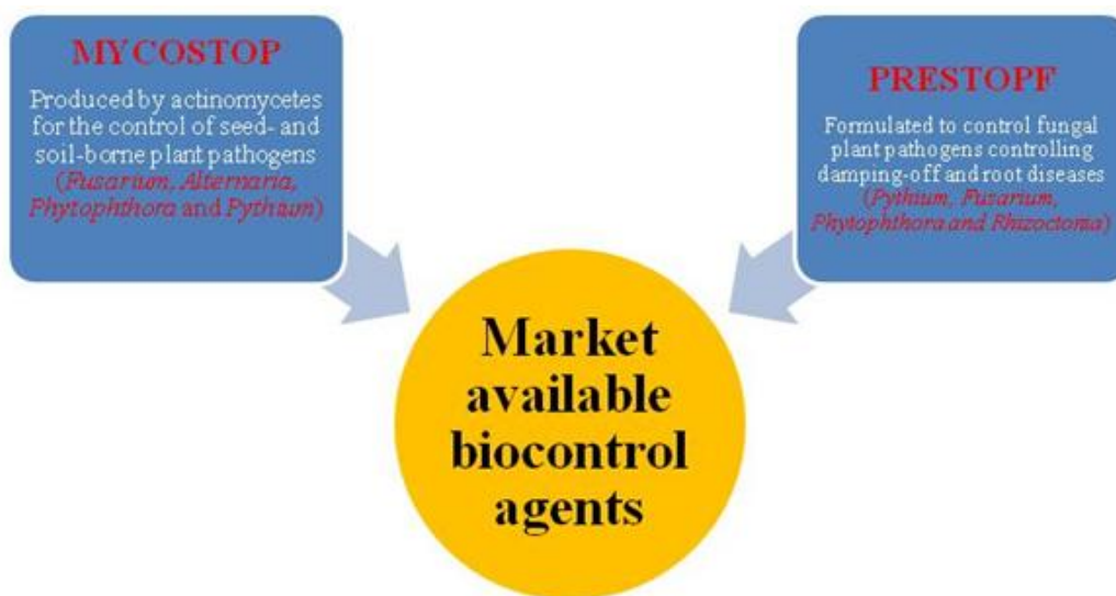
Figure 2: Markedly available products

developed to effectively control fungal plant pathogens. PRE STOP is also used to effectively control the commercially available cucumber diseases Didymella ( Mycosphaerella ) gummy stem blight and Botrytis grey mold.