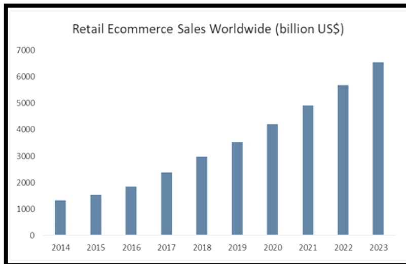
Figure 1: Retail e-commerce Sales Worldwide (2014 – 2023) (Statista, 2020)

From the retailers point of view too, online retail proves to be beneficial since it saves spend on real estate while at the same time it increases the customer reach. From the customer perspective there are certain momentous reasons for them to prefer online shopping: