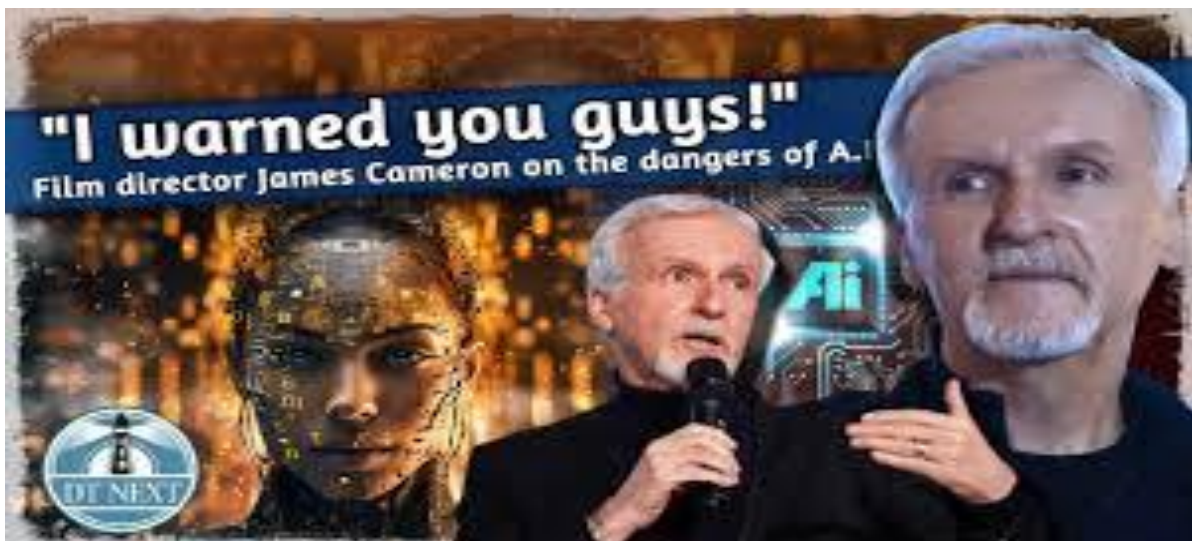
Table 3: Artificial Intelligence dangers warned in 1980's itself.

I think that we will get into the equivalent of a nuclear arms race with AI. And if we don't build it, the other guys are for sure going to build it, and so then it'll escalate."by James Cameron. According to Mr Cameron, the biggest danger lies in the weaponization of the new technology.