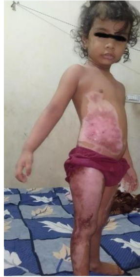
Figure 3: Burn Wound Healed By Bacteriophage Therapy 20th June 2022.

Materials and Method: Isolation of bacteriophages is done in microbiology lab [2]. 100ml of water specimen from river Ganga, hospital sewage and ponds are collected. It is centrifuged and supernatant is obtained. It is then treated for ten minutes with 1% chloroform. After that it is incubated for four hours to bring the lawn culture into log phase. This treated water is poured in 2 ml volume on 90mm petri plate and incubated overnight at 37 degree centigrade for plaque formation. If there is no plaques, the surface of plate is washed with 5ml TMG(Tris magnesium chloride) buffer(pH7.0). The washing is centrifuged and treated with chloroform 1% to lyse bacteria but sparing the protein coated viruses. The supernatant is now dropped on fresh lawn culture of the host bacterium in the log phase. The plaques are seen on next day after overnight incubation. The plaques having different morphology are cut and propagated on the host bacteria [Fig 4]. The number of specific phages is increased by inoculating larger surface area of Roux bottles. Then the sufficient harvested volume is subjected to membrane dialysis at 4 degree centigrade with three changes of 25 % PEG( polyethylene glycol) buffer three times. The purified phages are suspended in normal saline to have ready to use concentration of 10^9 CFU/ml of bacteriophages.