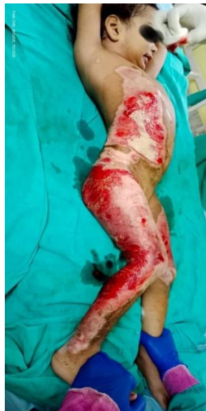
Figure 1: Extensive infected thermal Burn wound 5th Feb. 2022.

However, it has taken 4-5 months duration. The left thigh healed within 3 months, followed by the right leg and deep abdomen wound with necrotic slough took the longest time, about 5 months. No contractures and minimum scarring occurred. It prevented burn wounds from becoming full thickness loss due to infection, which seemed partial-thickness. Deep burn with necrotic slough also healed with repeated alternate day topical application of bacteriophages.