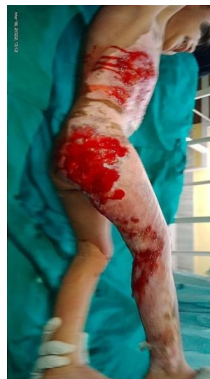
Figure 2: Progress of wound 19th March 2022