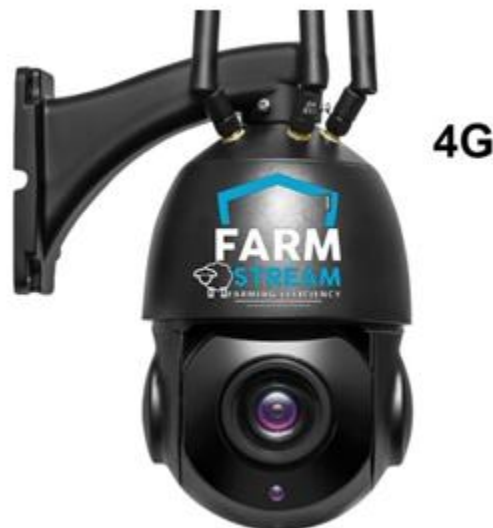
Figure 1: 360-Degree View Camera

A reliable and scalable smart traffic management system is created by the completely interconnected camera network and the central control centre. In order to increase mobility and lessen congestion, local authorities may use this architecture to monitor traffic conditions in real-time, make data-driven choices, and apply dynamic traffic control techniques. The system can react to shifting traffic circumstances thanks to the integration of AI algorithms with the camera network, making it an effective tool for controlling traffic in a busy metropolis. Figure 1 shows a representative feature of such a camera.