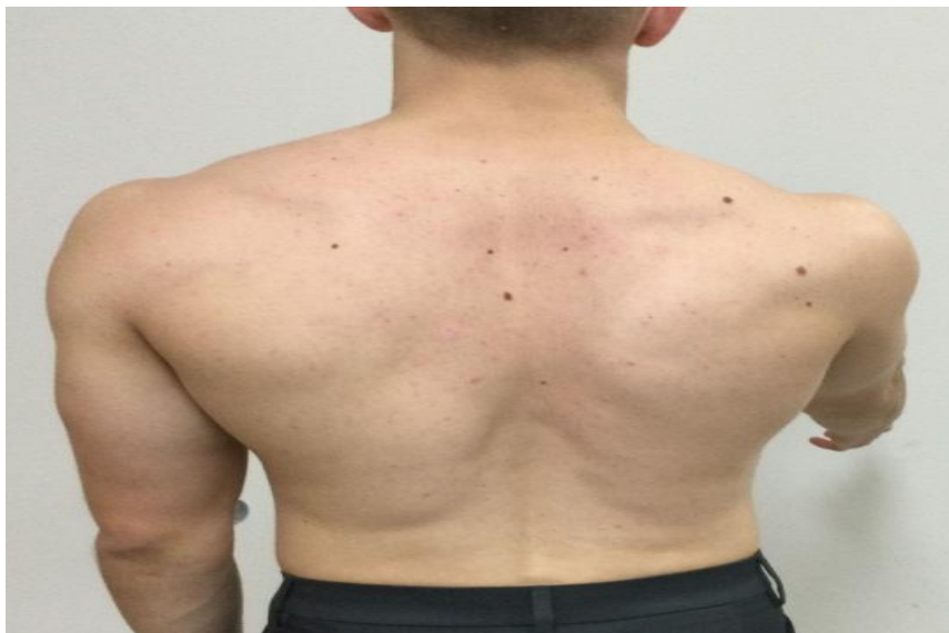
Figure 1: Scapular Dyskinesia Test. While Being Examined, the Patient Raises their Arms Above their Heads Three to Five Times.[6]

It is determined whether the outcome is "yes" (prominence detected) or "no" (prominence not detected) by observing the prominence of any part of the medial scapular border on the affected side.