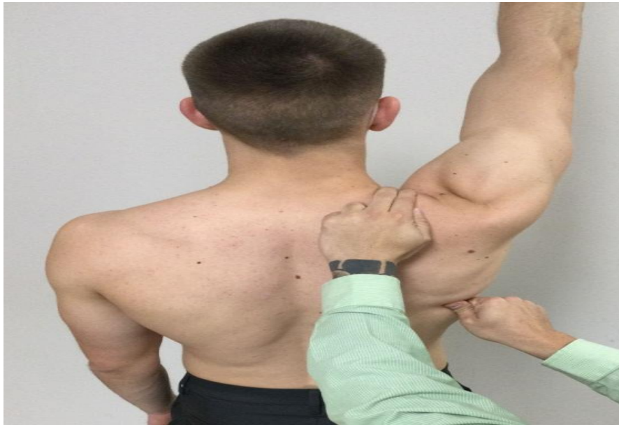
Figure 2: Scapular Assistance Test. One Hand Stabilises the Scapula While the Other Helps it Move Through its Proper Motion Plane.[6]