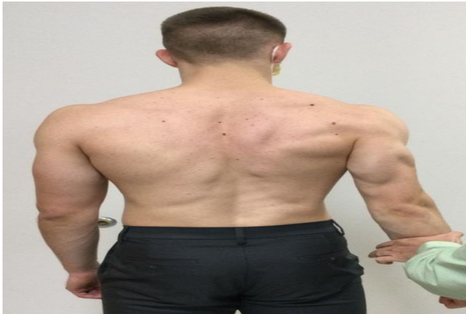
Figure 4: Low Row Test. The Tester Manually Opposes Arm Extension without Then Activating The Gluteal Muscles.[6]

This qualitative method is based on recent ideas to use a classification system in the clinical context that is rely on mobility deficits rather than pathoanatomy.