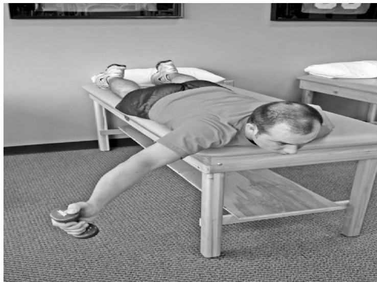
Figure 6: An Illustration of an Open Chain Exercise that Encourages the Activation of the Supraspinatus and the Rhomboid. [5]

The purpose of "Closed Chain" exercises is to improve the rotator cuff muscles' coordination and awareness of their position in space (proprioception). Furthermore, by isolating the weak muscles and reducing the action of the more powerful people, muscle strength can be attained.