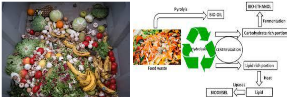
Figure 4: Food Waste as Energy Source