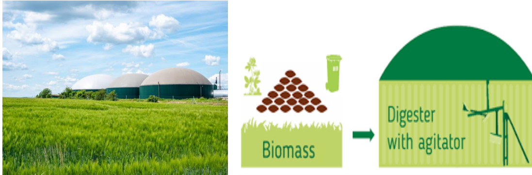
Figure 3: Biogas Plant

Animals can be utilized as a source of biomass energy through various methods. Here are a few examples: