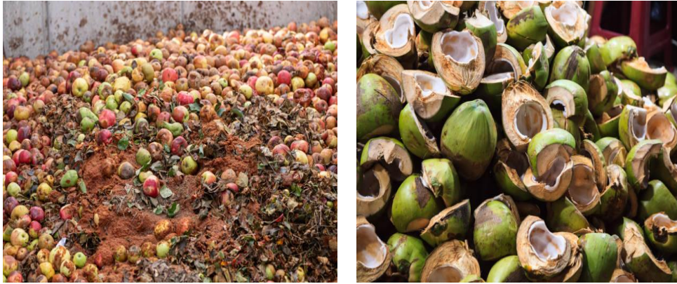
Figure 2: Plant Biomass

Plants can play a significant role in the production of biomass energy, providing a renewable and environmentally friendly alternative to fossil fuel. Here are some key points about using plants as a source of biomass energy (Figure 2):