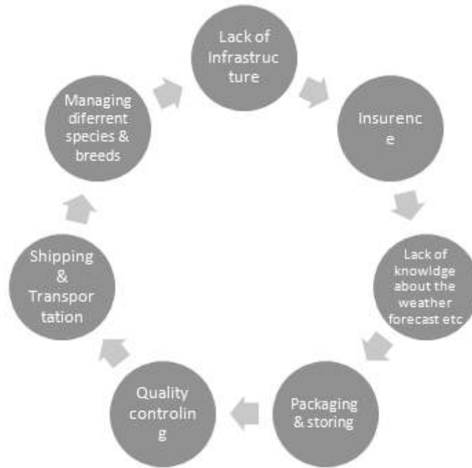
Figure 2: Few problems faced by farmers

Agritech may be utilised to raise sustainability, lower costs, increase yields, and improve efficiency. Recent years have seen a rise in its importance as a result of rising food demand and an ever-present danger from climate change to food security. There are many issues faced by farmers on daily bases like shown in fig: 2