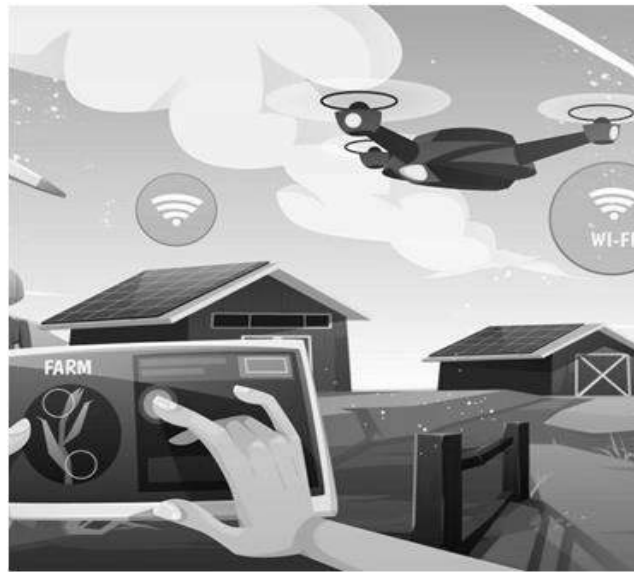
Figure 4: Image presentation of scenario in Agritech (Source equinoxsdrones.com)