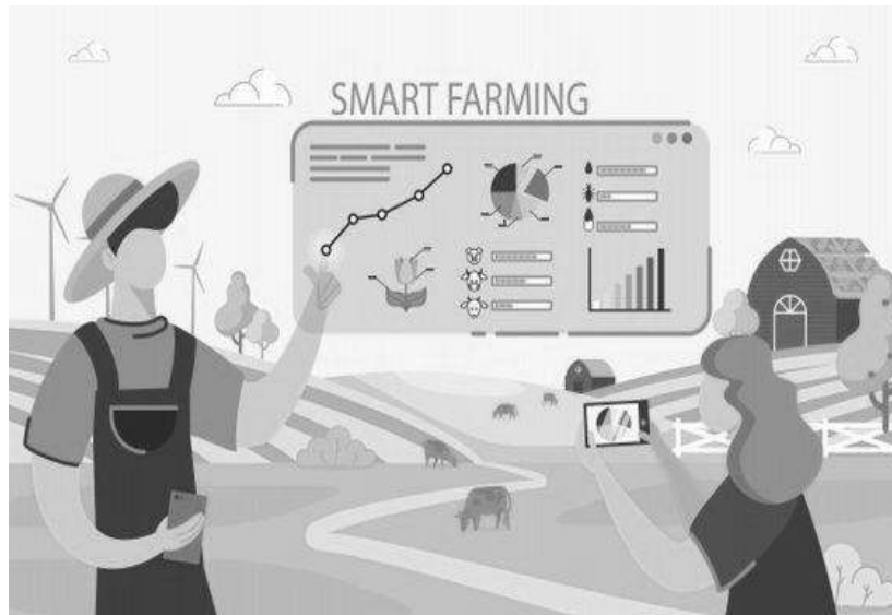
Figure 4: Image representation of smart farming scenario

IoT can help by allowing for the monitoring of infrastructure-related operations. To monitor changes or developments in the structural components of buildings, bridges, and other infrastructure, for example, sensors may be utilised. It provides immense advantages such as cost reduction, time savings, and improvements to the paperless workflow and workflow's quality of life as shown in fig: 4.