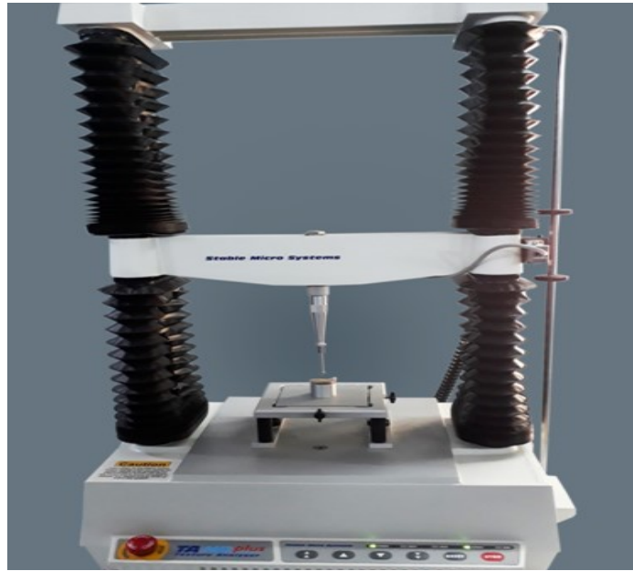
Figure 3: Stable Micro System TA-HD plus Texture Analyzer