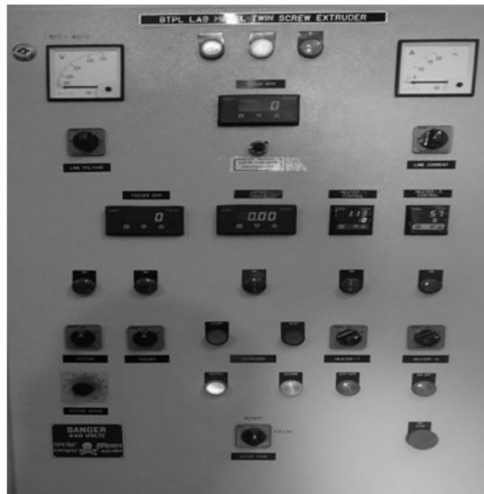
Figure 2: Control panel