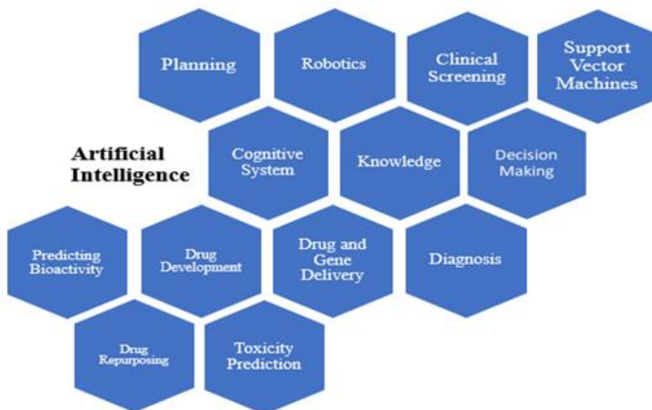
Figure 1: Artificial Intelligence is being used in a Variety of Fields