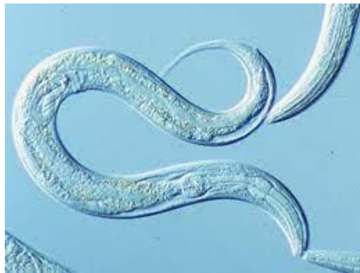
Figure 2: Transparent Microscopic Structure of C. Elegans

many of the molecular pathway signals controlling its development are also found in humans [2]. C. elegans can be grown easily and in large numbers on bacterial petridish plates containing E. coli bacteria as their natural diet. Cultures of C. elegans can be preserved as frozen and revived as per need. C. elegans is a small microscopic organism so it is convenient to keep in the laboratory and easy to maintain. The worm is clearly transparent because of this advantage the entire life cycle stage help us to study the behavior of each and every individual cell of the organism. C. elegans genetic map containing more than 100 genetic loci dispersed over six chromosomes, which are behavioral or morphological markers. On the other hand, C. elegans are easily amenable to various genetic manipulations. The viable fresh stocks of nematodes worms can be frozen in liquid nitrogen at -196 °C the procedure followed same for preserving the cell lines. Stored stocks have retained their live viability at -80 °C for the past 12 years.