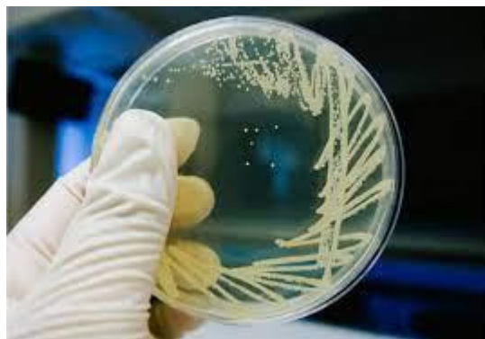
Figure 4: Saccharomyces Cerevisiae on Culture Plates