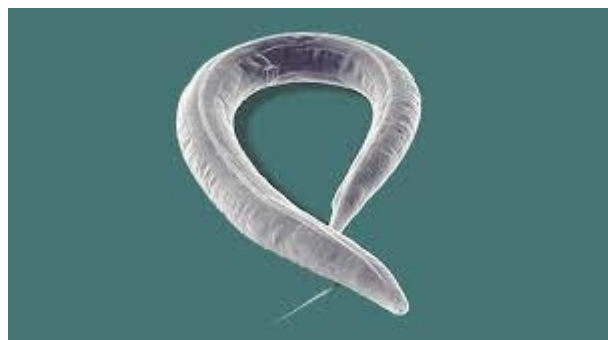
Figure 1: Soil Nematode Caenorhabditis Elegans