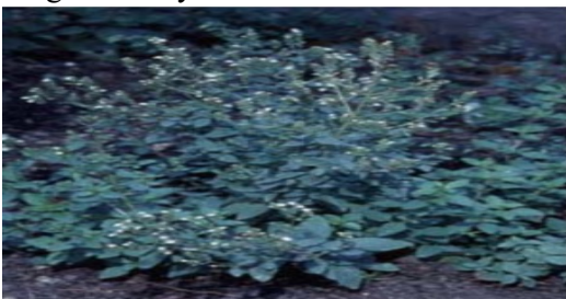
Origanum vulgare subsp. gracile