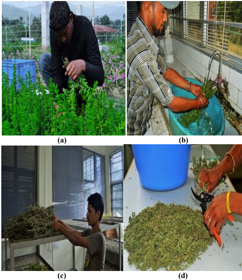
Figure 5: Post-harvest management practices of Origanum vulgare L. at CIMAP RC Purara, Bageshwar, Uttarakhand. (a) Captures the harvesting process of the Origanum vulgare L. crop, showcasing the initial stage of post-harvest management. (b) Illustrates the meticulous washing of the fresh herb before it undergoes the drying process. (c) Highlights the collection of the dry herbs of Origanum vulgare L. , marking a significant phase in post-harvest management. (d) Displays the step of cutting the dried herbs into small pieces, a crucial preparatory step before storage. These practices contribute to the effective post-harvest handling of Origanum vulgare L. at the research center.

shade drying without air, which yields a dark green color. (d) Represents sun drying, characterized by a brownish coloration. This investigation was conducted at the CSIR-CIMAP Research Centre in Purara, shedding light on the diverse color outcomes associated with different drying techniques.