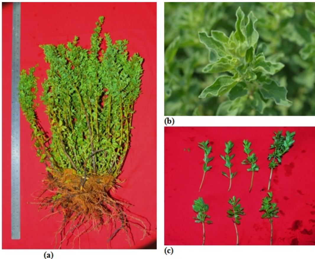
Figure 1: Illustrates Origanum vulgare L. at different stages, including a (a) full plant view with the root zone, the (b) aerial part of the plant, and a (c) fresh cutting.