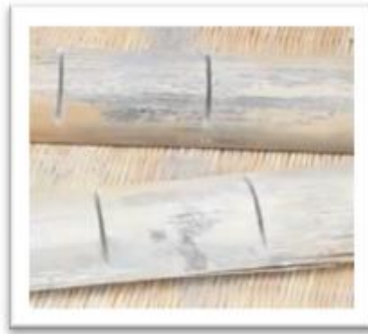
Figure 1: Pictorial representation of Holder