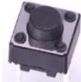
Figure 3: Pictorial representation of switch