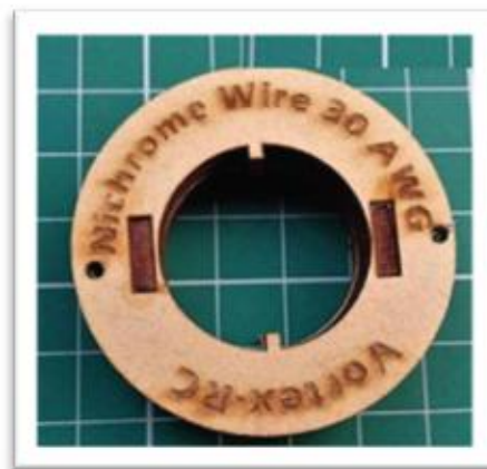
Figure 2: Pictorial representation Nichrome wire