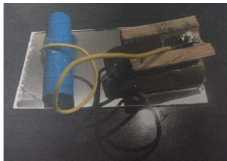
Figure 4: Pictorial Representation of Small Size Packet Sealing Machine

A heat-sealing machine is a type of sealer that encloses things using heat as the sealing agent. It functions by sending a high current impulse to the heater ribbon located on the device's surface. The heat wave created by this is powerful enough to melt and seal the bag or sheet that is sandwiched between the sealing bars. Most manufacturers will provide temperatures for sealing each film, and this provides a good starting point for the heat or time. It is generally recommended to start with a heat time of two seconds at 200° F and a cool time of two to three times the heat time. Heat sealers are used in many food packaging industries to seal the materials having thermoplastic layer. Firstly, sealing bar is heated to the required degrees of temperature, material melts and gets joined just like a zip liner bag.