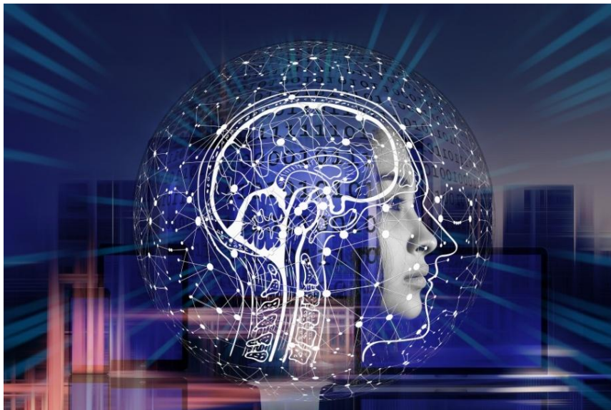
Figure 1: AI Sentient [1]

Navigating the complex landscape of cognitive architecture, this chapter unveils the underlying mechanics that empower machines to replicate intricate cognitive processes. Yet, as technology ascends to newfound cognitive heights, the ethical spotlight intensifies. The narrative deftly explores the moral dimensions that arise when AI inches closer to self-awareness, prompting reflections on the evolving relationship between human creators and their artificially intelligent creations.