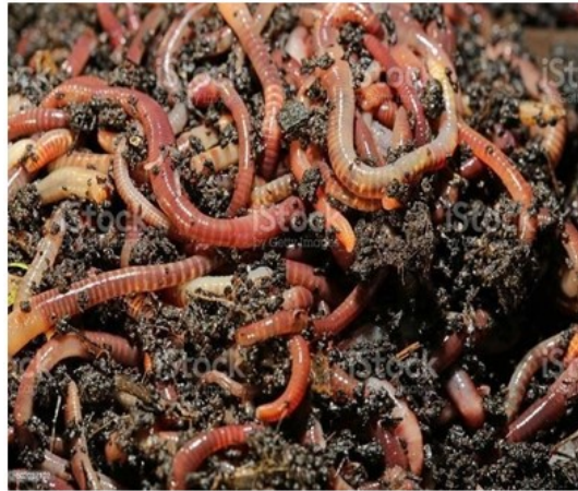
Figure 4: Using Earthworm for Vermicomposting.

The voyage of vermicomposting teaches us how to coexist with nature without harming it. It conserves soil fertility while reducing environmental pollution and the usage of non-renewable natural resources. The practical and distinctive vermicompost for farmers' usage is generated through the application of vermitechology at the lowest possible cost as investigated by Gupta, (2012)