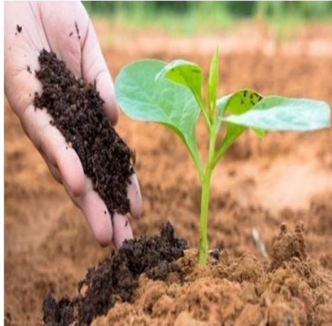
Figure 3: Uses of Organic Fertilizers Source- https://homegrown.extension.ncsu.edu/

Singh et al. (2005) studied the response of Vermicompost was applied to a chilli plant ( Capsicum manuum L.), and it was discovered that this increased microbial activity. Due to a greater quantity of branches and fruits, vermicompost improves the performance of crops.