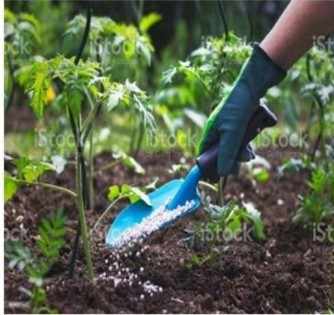
Figure 1: Uses of chemical fertilizers

Farmers employ large quantities of chemical fertilizers and pesticides nowadays to increase the output of a variety of agricultural crops. These toxic insecticides and fertilizers reduce soil fertility while harming customers' health. The usage of organic manures has sparked attention due to the negative impacts of chemical fertilizers as reported by Alam et al. (2007).